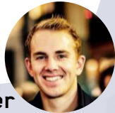
Devin Finzer OpenSea Co-founder & CEO

OpenSea is a trading platform for non-interchangeable tokens. It was founded on December 20, 2017, by Devin Finzer and Alex Atallah in New York City. OpenSea platform allows you to sell, buy and create your own NFT tokens. The platform operates on the principles of a decentralized community: cryptocurrency wallets, addresses and assets are controlled by users. The marketplace protocol supports Ethereum, Polygon and Klaytn Blockchain. NFT's trading volume increased 400-fold in 2021. A record number of transactions (more than $12.5 billion) were made through the NFT OpenSea Marketplace.