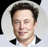
Elon Musk SpaceX Founder & CEO

SpaceX designs, manufactures and launches rockets and spacecraft. SpaceX was created by Elon Musk to revolutionize the aerospace industry and make space travel an affordable reality. Currently SpaceX is working on a new generation of reusable launch vehicles that can take people to Mars and other planets of the Solar system. SpaceX owns Starlink which provides a global satellite system. It has already launched more than 2 000 satellites to provide high-speed satellite broadband Internet access in places where it was unreliable, expensive or completely unavailable.